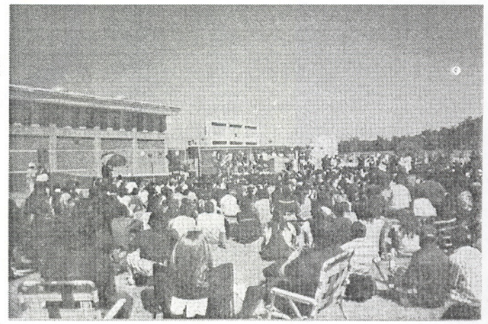
Program is the first of Violence Prevention/Bullying Program Kick-off.

The Violence Prevention/Bullying its kind to be imple-